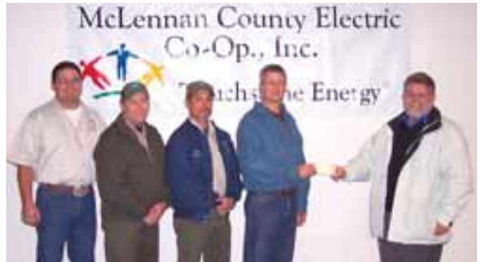
Mother Neff State Park Association