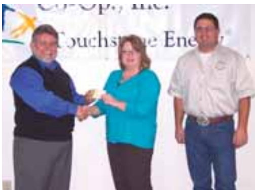
McLennan County Resource Center

McLennan County Electric Cooperative's Operation Round Up Helping Those Who Help Others