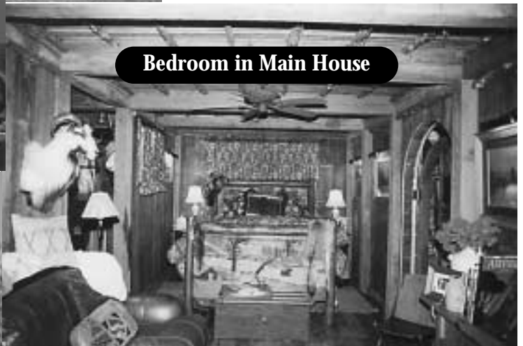
Bedroom in Main House