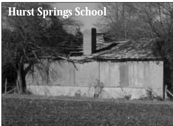
Hurst Springs School

springs were famous back then for being so cold in the summer, making it a great place for kids to hang out, swimming and waiting on a watermelon chilling in the springs. When you drive by, listen closely; you can probably hear the kids from years past laughing and having a good time.