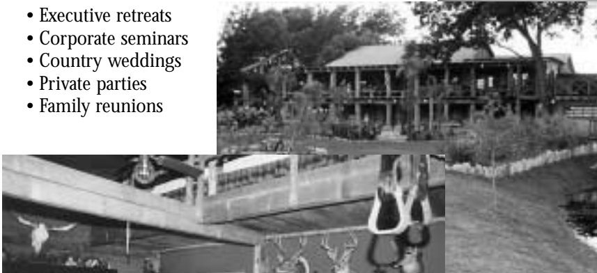
Entertainment Room in Main House

While visiting the ranch, we noticed how quiet and peaceful the atmosphere was, along with a sense of seclusion. The retreat consists of several buildings: dining/meeting hall, small chapel for weddings, large ranch house, various sleeping quarters and many outbuildings.