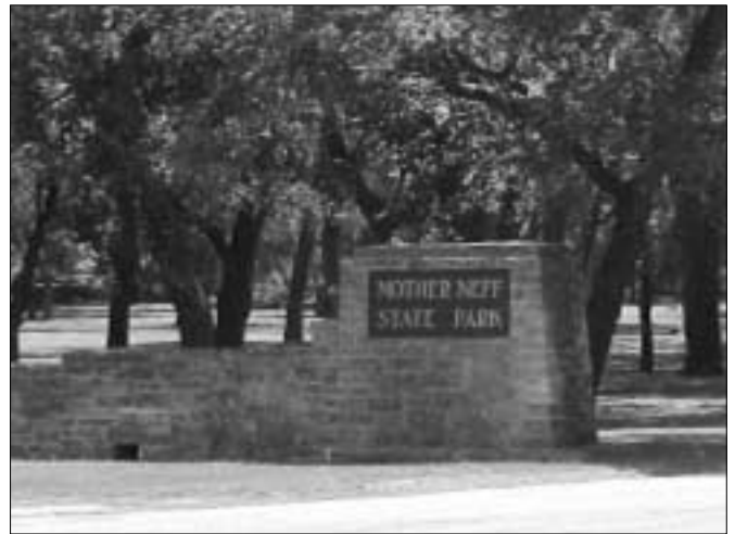
Best Sunday Afternoon Drive: Mother Neff