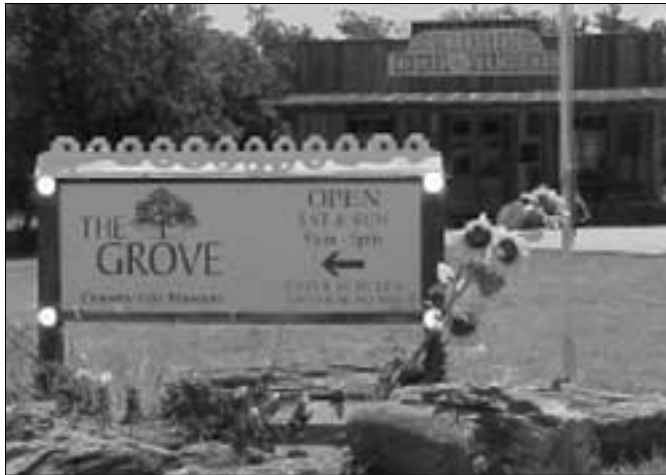
Best Place to Spend a Saturday Evening: The Grove

Listed here are some of our favorite places; these may be yours, too.