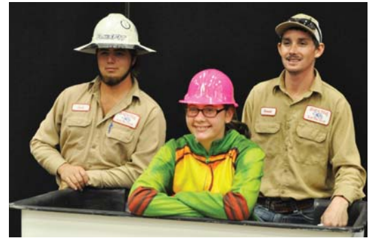
LEFT: Heart of Texas EC members were greeted by staff as they arrived at the annual membership meeting. RIGHT: Our youngest members enjoyed visiting and posing for pictures with the linemen.